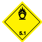
Class 5.1 HAZARD Oxidizing Substances

ADR , Annex A General provisions and provisions concerning dangerous substances and articles; Classification; Class Specific Provisions